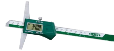
Digital Depth Gauges