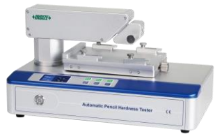
Automatic Pencil Hardness Testers