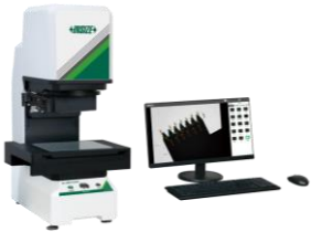
Quick Measurement Systems