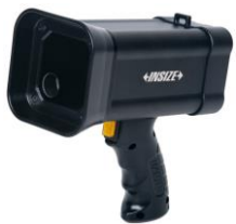
UV/White Light Flaw Detection Lights