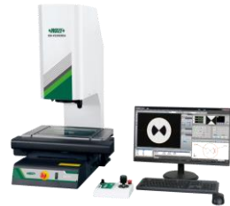
CNC Vision Measuring Systems