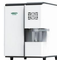
Carbon And Sulfur Analyzers