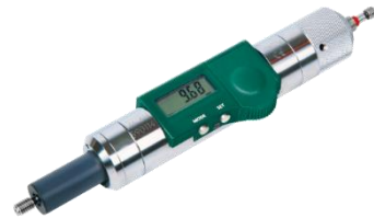
Digital Thread Depth Gauges