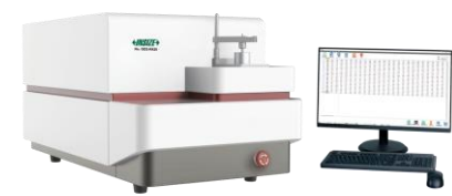
Spark Direct Reading Spectrometers