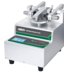
Rotational Abrasion Testers