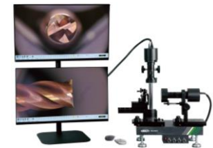
Dual-Display Cutting Tools Microscopes