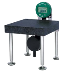
Flatness Measurement Stands