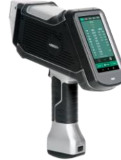
Handheld Libs Spectrometers