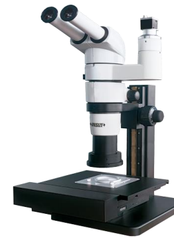
Automatic Cleanliness Analysis Systems