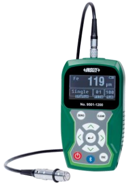
Coating Thickness Gauges