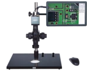
Digital Measuring Microscopes