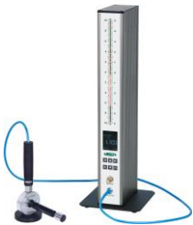
Air Gauges And Displays