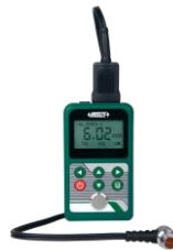
Ultrasonic Thickness Gauges