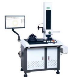
Roundness Measuring Machines